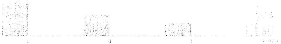
Percentage Scoring at Levels